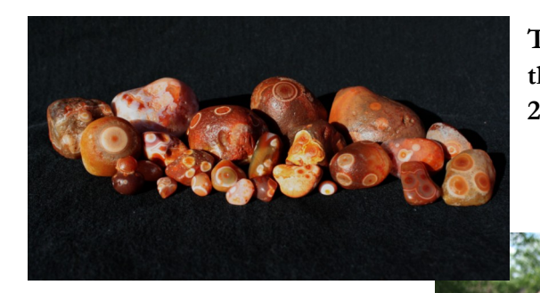
Collection of Eye Agates↑

Group Tours-please call the Museum at 253-9614 and we will schedule for your convenience.