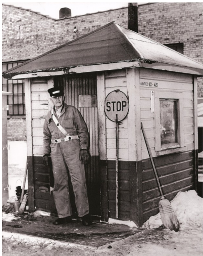
East Side St. Cloud Guard Shanty

You may have read before in a former newsletter that we are going to be working on restoration of the East Side St. Cloud Guard Shanty that was on St.. Germain. The shanty was used for many years by the railroad companies as a guard shack . Whenever a train would be approaching the East St. Cloud Depot, the guards would have to come out of the building with their traffic signs and hold the cars from crossing until the train was through. As time went on and new technology became available, wooden stop arms, metal stop-arms and then mechanical arms replaced the guards and the shanty.