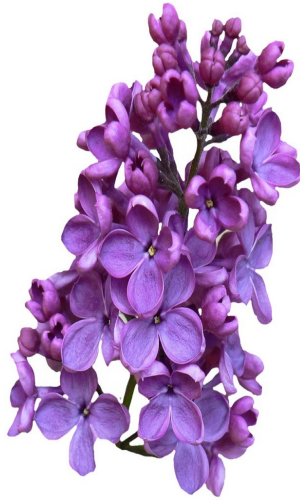
Lilacs— the flower of May!

Hope everyone is getting a chance to enjoy the Spring season with new flowers, leaves back on the trees and green grass back for all of us to enjoy for awhile! I could not resist putting the lilac on the left as I when I drive to work every morning, the old neighborhoods have the sweet smell of lilacs all through their neighborhoods!