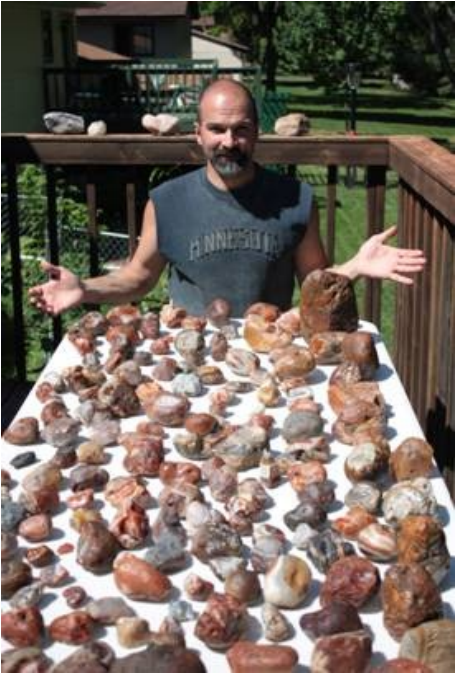
Lyndon Johnson pictured with part of his agate collection

Agate (pronounced /ˈæɡət/ ) is a microcrystalline variety of quartz silica chiefly chalcedony, characterized by its fineness of grain and brightness of color. Although agates may be found in various kinds of rock, they are classically associated with volcanic rocks but can be common in certain metamorphic rocks.