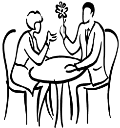
Come join us!