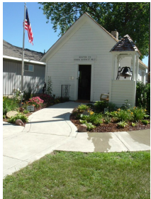
Watab Number 2 Schoolhouse