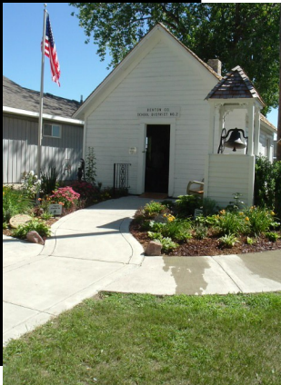
Watab District Number 2

Seeds of faith are always within us; sometimes it takes a crisis to nourish and encourage their growth ~Susan Taylor