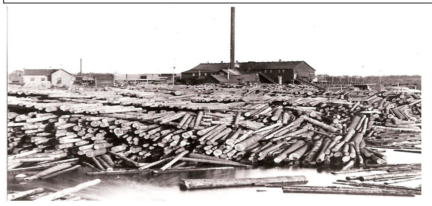
Pictured above- a logging section sometime in the 1920's with logs in storage piles.

We try to find interesting pictures and information on Benton County History to put in the newsletter!