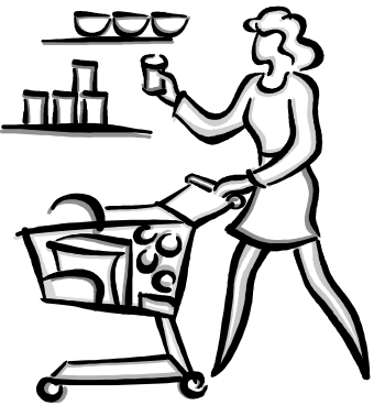
Saving your grocery receipts helps us!

We will be having a basket at the Museum for the receipts or you may mail them to us at: BCHS PO Box 426, Sauk Rapids, MN. 56379