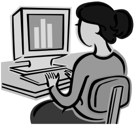
Quicker genealogy from home!

The colder, snowier winter season and the New Year that is upon us has stirred discussion here at the Museum as we sort through photos, newspaper clippings, and documents. “Preserving the past, and the present, for the future” which has been, and still is, our mission statement for BCHS and one that we feel is worthy. Our cause is community information that reflects time, people, events, lifestyles, history and the importance of retaining as much information of all of those things as we can. What valuable treasures of resources we have in our presence! History at our fingertips, and the promise to hand it forward as others did before us; even if it is only for reflection or discussion!